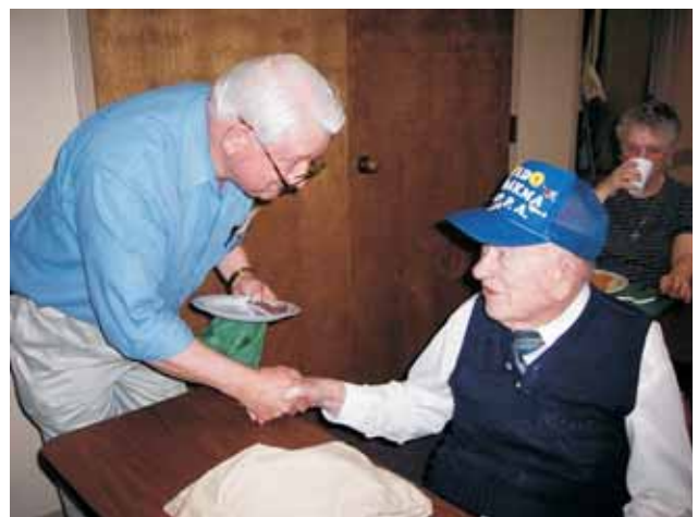
Old Friends Meet