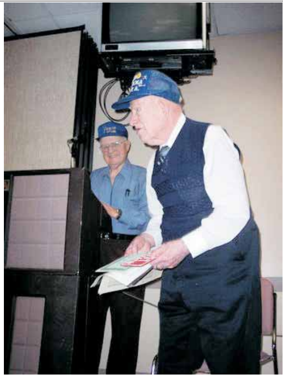
Another Tall Tale

Labels must be parallel to the bottom of the mail piece within 5 degrees. Please affix labels carefully. Cover this block completely.