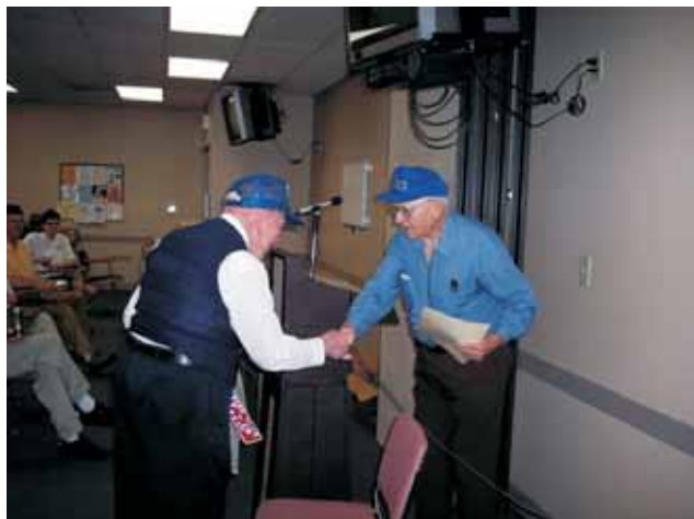
Charter Member & Early President