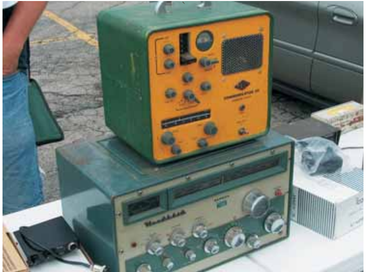
Plenty Of Used Equipment