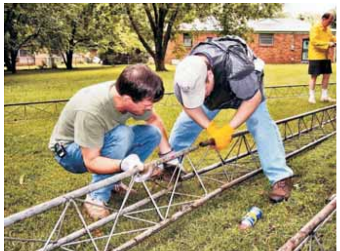
I think it fit last year!