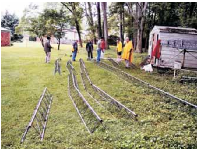
All Laid Out