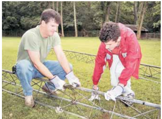
Father & Son Solution