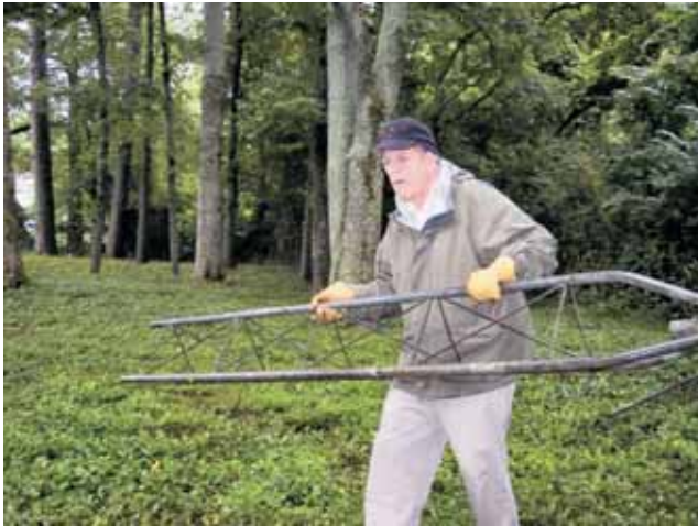
Top Section Tango

A team of HARC volunteers spent several hours in W4HFU's back yard checking over the FD essentials stored there. A CD with the pictures on this page appeared at W4HFU's door the next day..