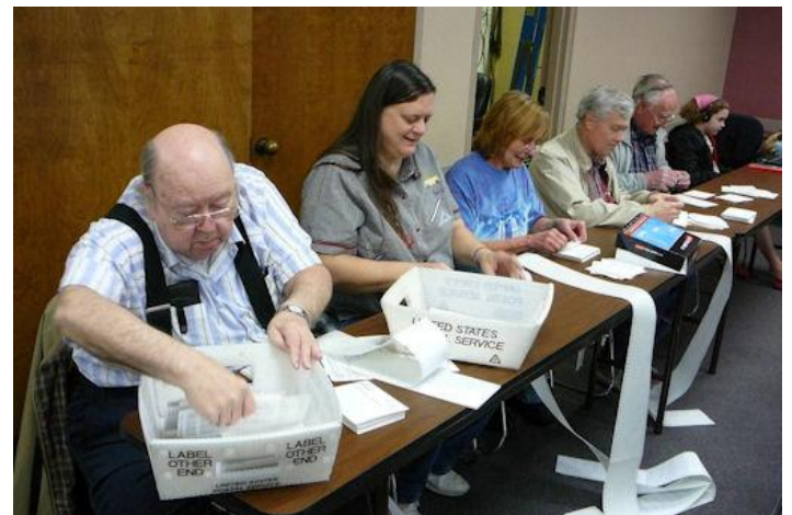
Preparations For Membership Mailout