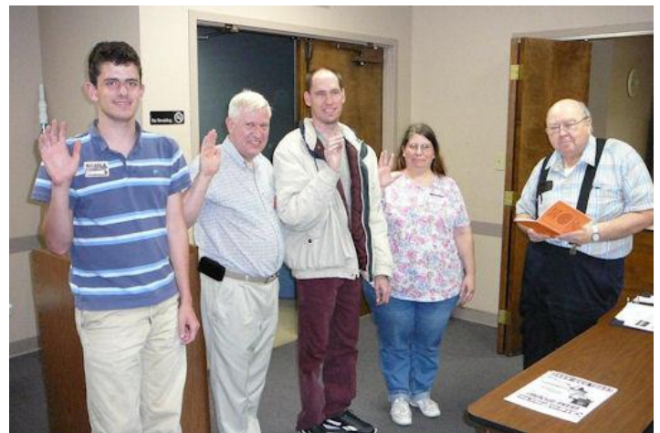
Swearing In Of HARC Officers For 2007/2008